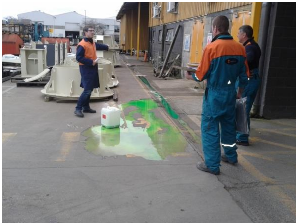
FIGURE 1: QEC SPILL RESPONSE TRAINING COURSE

We have a well-earned reputation for excellence and our specialised industry and regulatory knowledge enables us to provide our clients with consultancy across the fields of quality, health and safety, and environmental management.